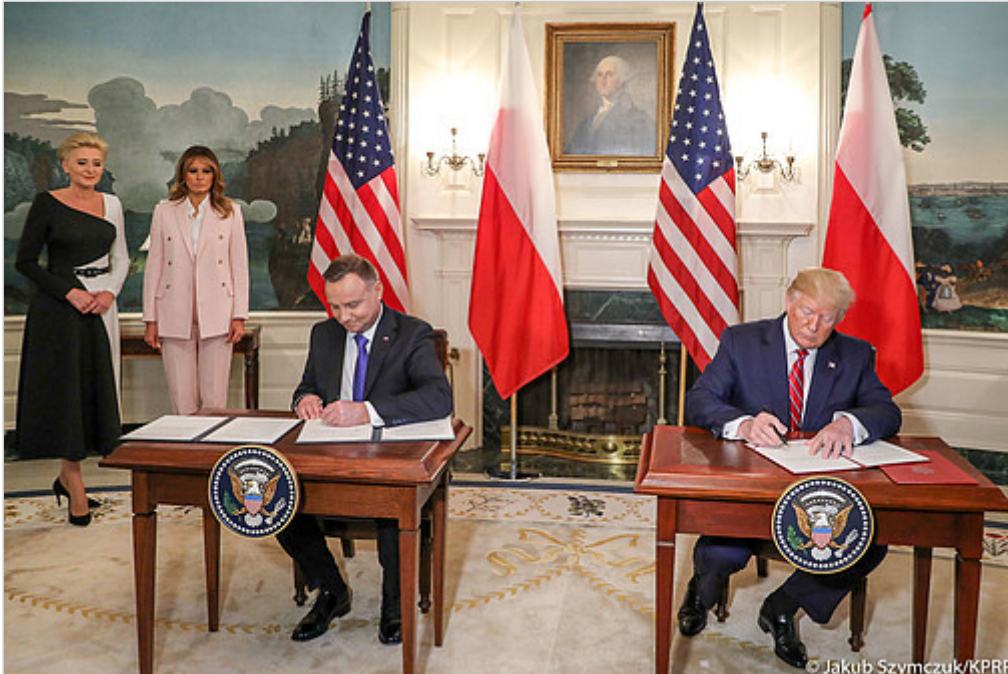
Andrzej Duda, Donald Trump sign Joint Declaration on Defense Cooperation Regarding U.S. Force Posture in Poland (1 / 4)